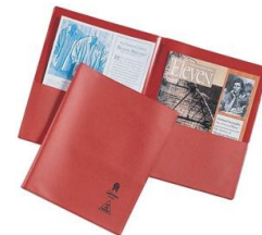
4 plastic pocket folders (with brads)

Your student's teacher will have a specific classroom list. Thank you!