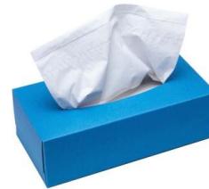
2 tissue boxes