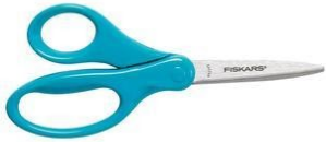
1 pair scissors (Fiskars)