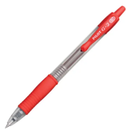
1 red ink pen