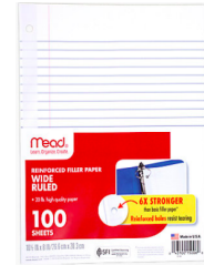
1 pack paper (50-100 count, wide-ruled)