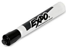
dry erase markers (4 pack)